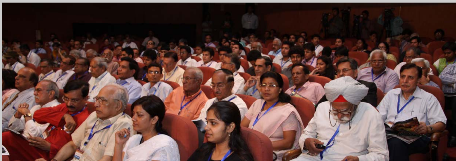
Justice PV Reddy

“Black money is the source of all ills in the country; many scams involving public property is an expression”